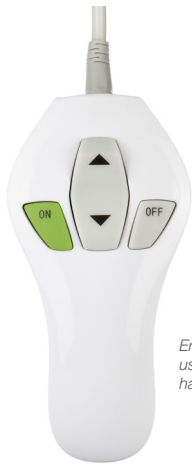
Ergonomic and user-friendly hand control

For professional and highly functional care environments with a harmonic and human atmosphere.