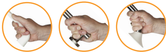
Table 2, Handbreadth without thumb (nr. 44) 4