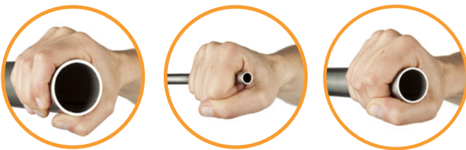
pict. 1 pict. 2 pict. 3

For defining the diameter of the tube, the results of anthropometric ("the measuring of people") studies on grip circumference are used. Percentile values (P-values) give basic information on the frequency of a certain characteristic in a group of people. The results of the average group are P50. The results of the groups with smaller hands (P5 and P1) are shown in table 14.