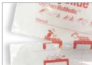
Perforated at 50-cm / 19.6" intervals; just unroll and tear off the desired length.