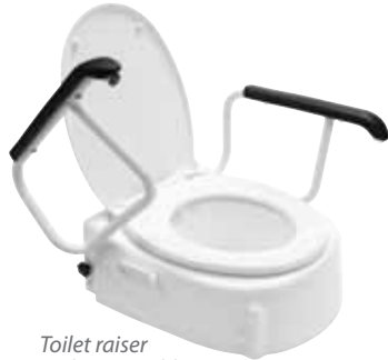
Toilet raiser with removable, independent, swivel armrests and lid