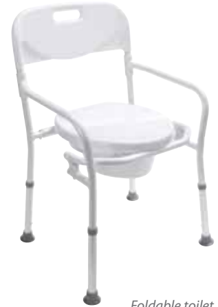
Foldable toilet frame with backrest, for extra comfort and support