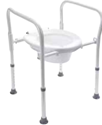
Foldable toilet frame

Ready for life™ foldable toilet frames offer flexible solutions for many situations when using a regular toilet is too difficult. They provide increased height (adjustable), extra support and can be used as toilet frames over existing toilets or standing alone, with bucket and lid, as bedside commodes. The foldable toilet frames can also be used as shower chairs. The compact format, the light weight and the foldable design of the toilet frames, makes them very easy to move and store. They are also perfect for travelling.