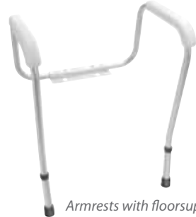
Armrests with floorsupport