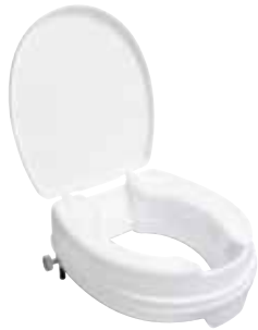
Toilet raiser with lid

Ready for life™ offers two different solutions for increasing the height of a toilet. Both toilet raisers fit most standard-size toilets and both are very easy to install, no tools needed.