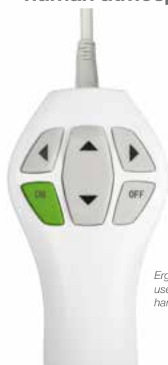
Ergonomic and user-friendly hand control

For professional and highly functional care environments with a harmonic and human atmosphere.